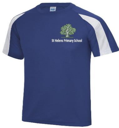
Royal Blue Logo T-Shirt