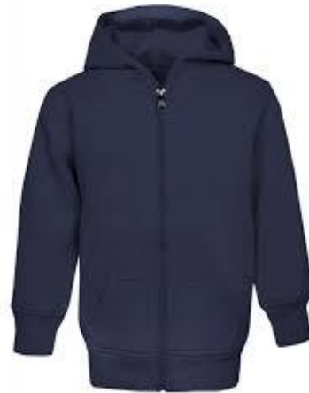
Navy Blue Hooded Top