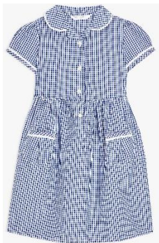
Blue and White Gingham Dress