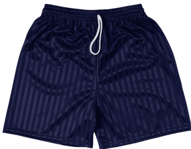
Navy Blue Shorts