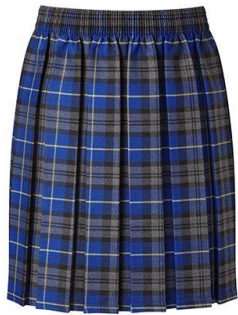
Royal Blue Tartan Pleated Skirt